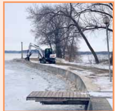
Lone Tree Point riprap

In a COVID-19 era, we are reminded that God does the miracles, and we go forward in response, pursuing His plans that give us a future and a hope. We are thankful for your generosity and ask for your continued prayers, volunteerism, and financial support – key parts of God’s manna to bring us through spring and into summer.